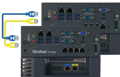
ztC Edge 250i

When deployed as a redundant pair, ztC Edge platforms are hot-swappable and auto-synchronizing, making field repairs quick and easy. Maintenance or repairs to individual computers can be completed while the node is running and without a system reboot, ensuring service continuity. This allows OT or IT staff to plan and complete a system repair when it is convenient.