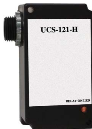
UCS-121 Hub Enclosure