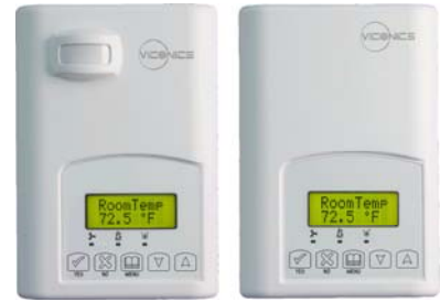
Fig.1 VT76x7B Thermostat