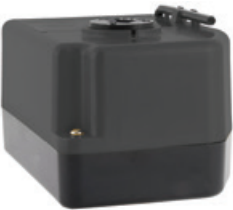
Spring Return Normally Open/ Normally Closed Two-Position VBB/VBS Series Ball Valve SmartX Actuator