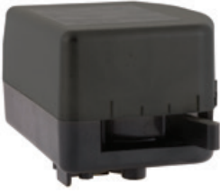
Non-Spring Return Floating/ Proportional VBB/VBS Series Ball Valve SmartX Actuator