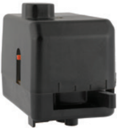
Spring Return Normally Open/ Normally Closed Floating/ Proportional VBB/VBS Series Ball Valve SmartX Actuator