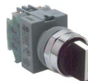
Knob Style Selector Switch