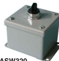
ASW320 mounted in E-1PBG