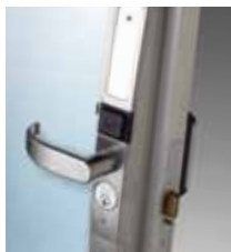
ADAMS RITE A100