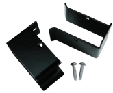
AH06 CT Mounting Brackets