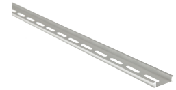
AV01 35 mm DIN Rail - 1 Meter Length