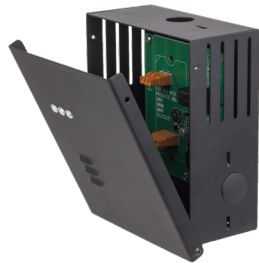
AGPE Enclosure (sold separately)

GWNP Series protocol communications platform offers a convenient means for sensing gases in the environment. The GWNP is mounted to any single-gang electrical box and wired to the building controller. Then, a single AGxx gas sensor (sold separately) is installed in the GWNP. With this design, there is no need for a costly new installation when a sensor reaches the end of its life. The GWNP platform remains installed, and the installer simply opens the GWNP housing to replace the modular sensor inside, reducing labor costs and downtime.