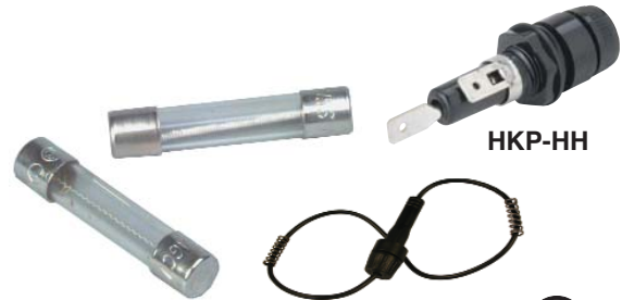
GF, K235 Series