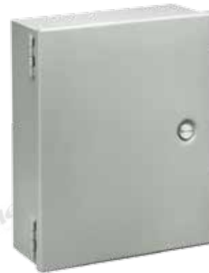
Nema 1 Small